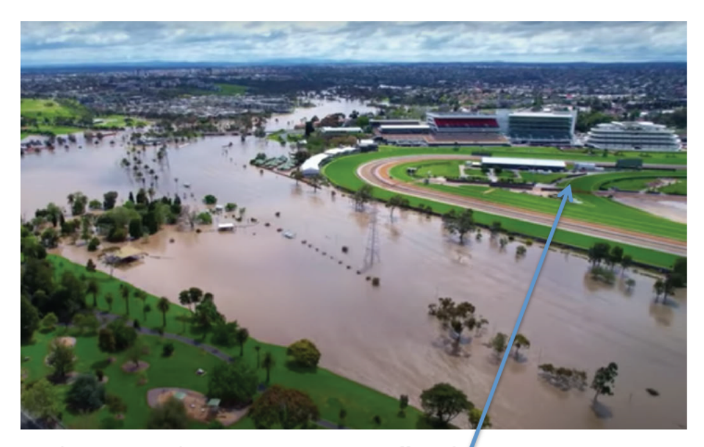
October 14 2022, Flemington Racecourse unaffected

Why do Melbourne Water and VICSES continue to publish misleading information? Why is Melbourne Water in 2023 continuing to model Flemington Racecourse as flooding, when it has been proved that it won't, because of its 2007 flood wall? Why are maps which are critical to intelligence and planning, not updated with current information?