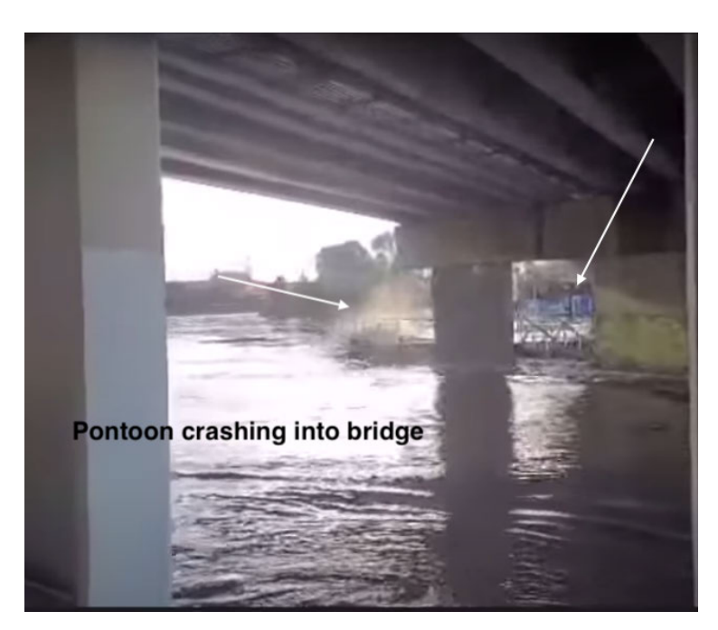
Angliss Stock Bridge, Kensington, 14 October 2022

Were they at risk? Most certainly, and the conditions in which they were working were a potential threat to life, of themselves and any resident in the boat with them. It is only because of the skills of the volunteers and pure luck that no lives were lost, including lives of SES volunteers who were tasked with more than 30 boat transfers of people and domestic animals in dangerous conditions and fast-flowing water during the event. The debris washing down the river at speed included two whole pontoons ripped from their moorings, a shipping container, numerous industrial waste bins, tree branches and other items. It was reported that a shipping container washed up only 100 metres from the volunteers' boat launch and recovery point.