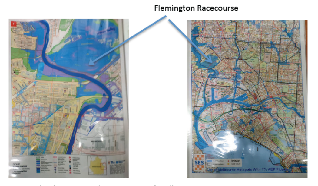
VICSES Flood maps: Maribyrnong, City of Melbourne

Even more concerning is that in March 2023 Melbourne Water, who produce the flood maps data, also included Flemington racecourse as being flooded in their own submission to their own enquiry into the Maribyrnong floods (Melbourne Water submission, MRFR 53, p 11).