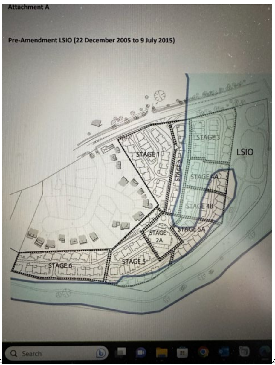
<u>The 100-year flood line over the Rivervue site</u>, prior to extinguishing the LSIO.