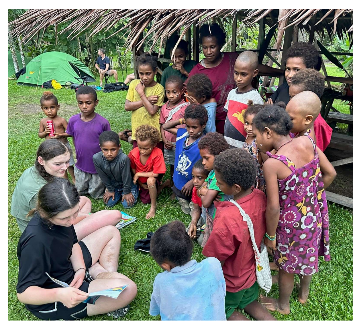
Scholarship winners getting to know some of the local children in Kovello Village