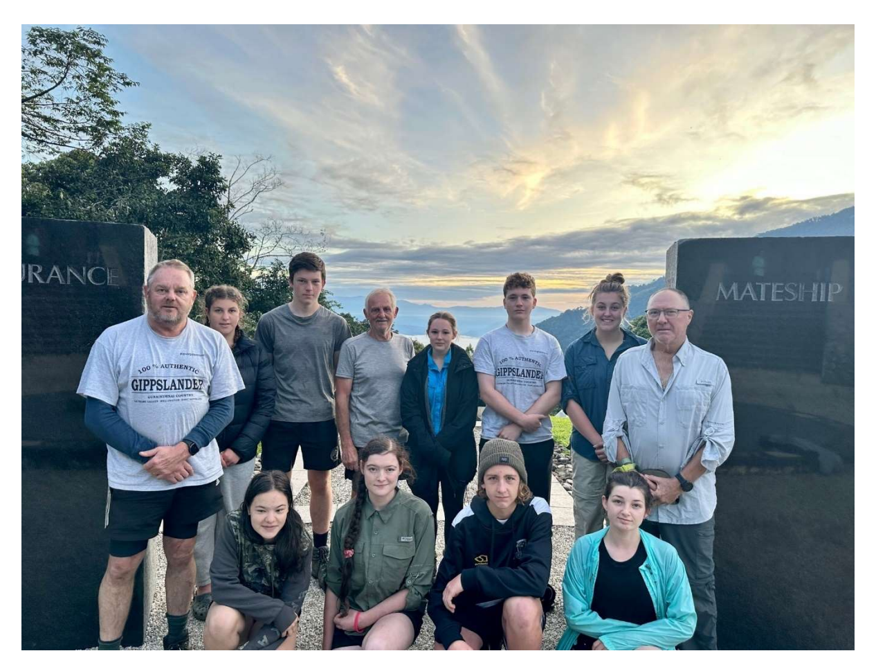
The Dawn Service at Isurava is a surreal Moment on the trek.

One of the highlights of the entire trek is the Dawn Service at Isurava, which in the breaking light looking over the memorial and fog filled gully backdrop is quite surreal.