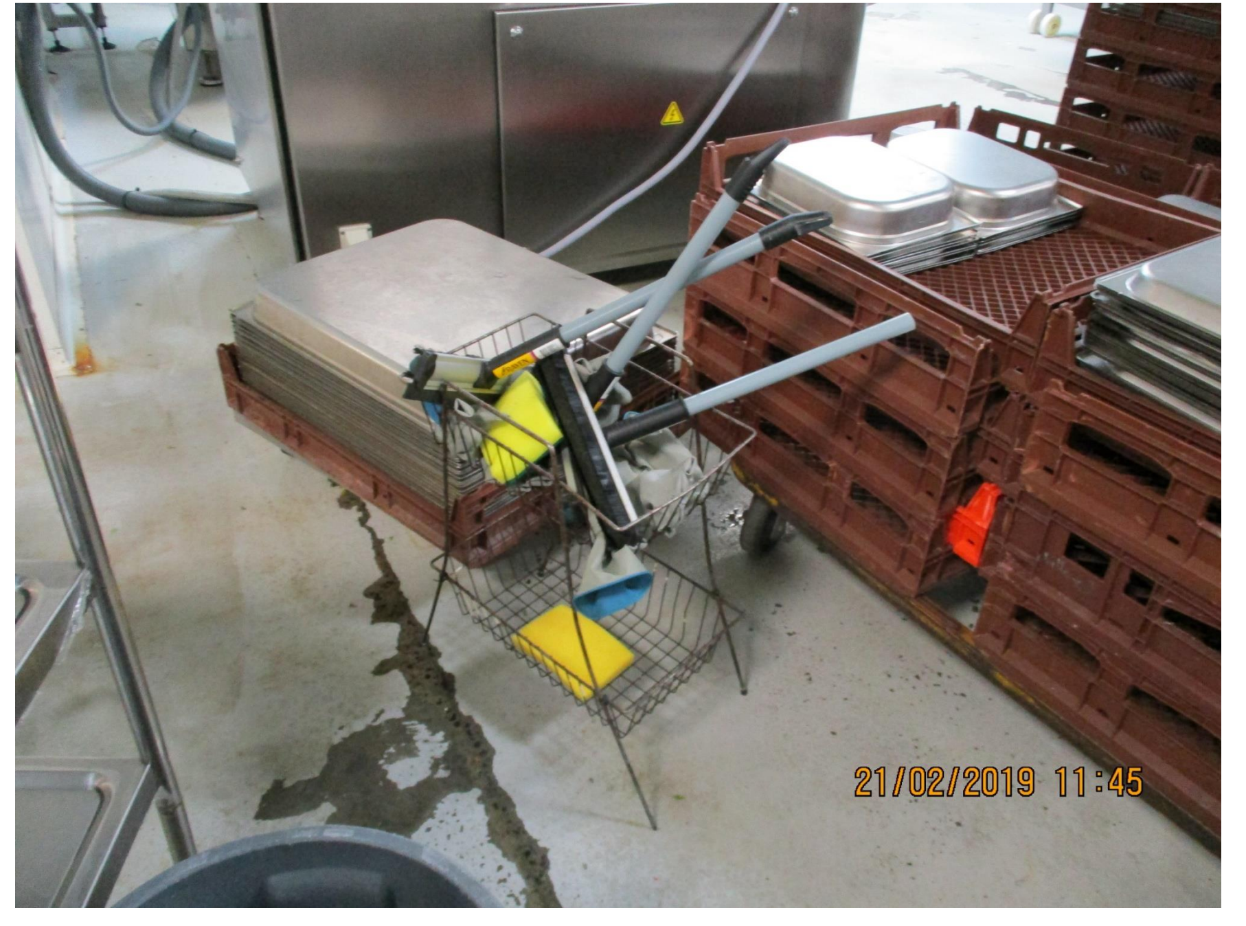
I Cook Foods – Main Kitchen photo depicts cleaning equipment in rusting metal unit next to cleaned food equipment