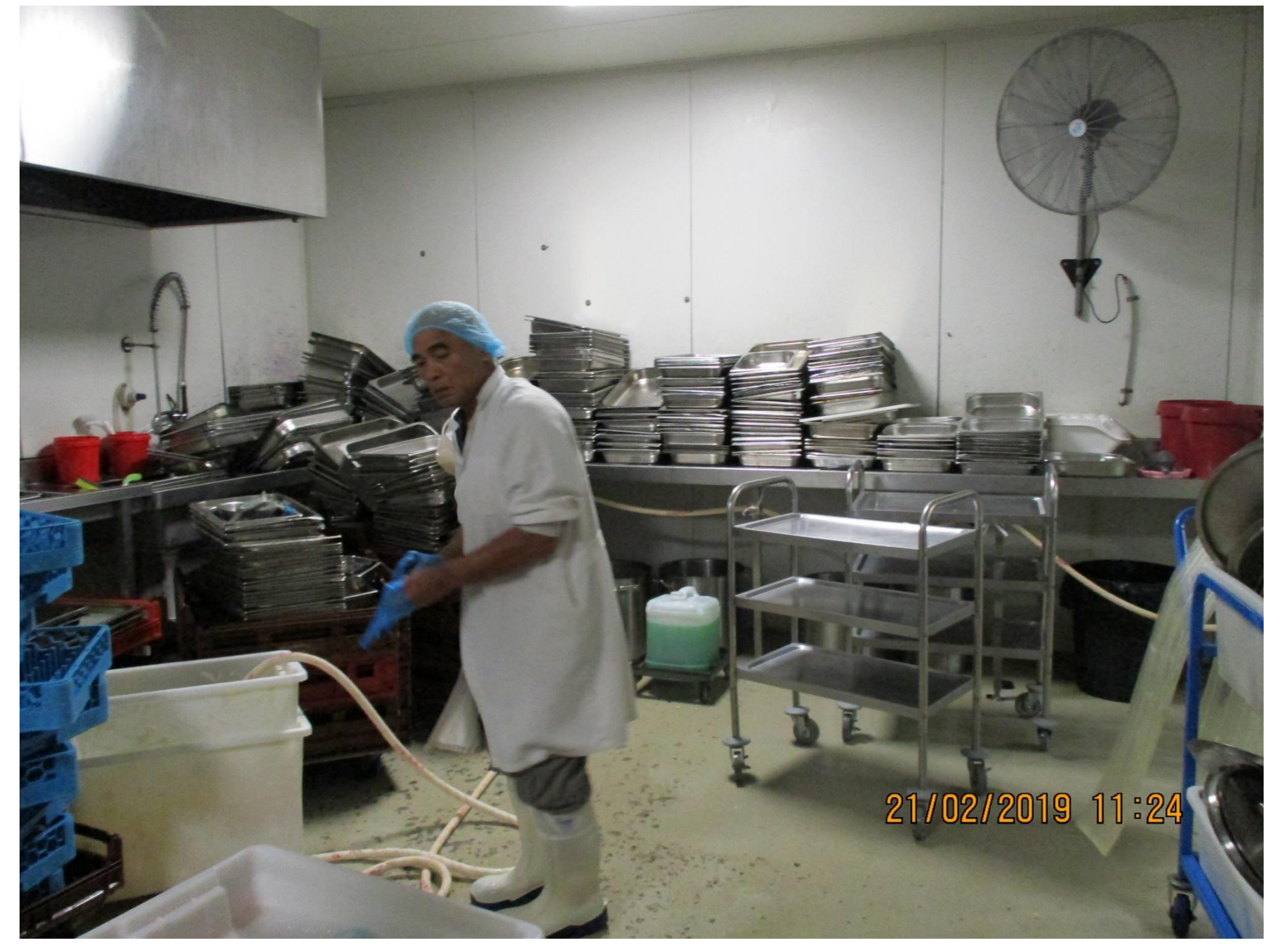
I Cook Foods – Scullery Room photo depicts excessive amounts of dirty food equipment