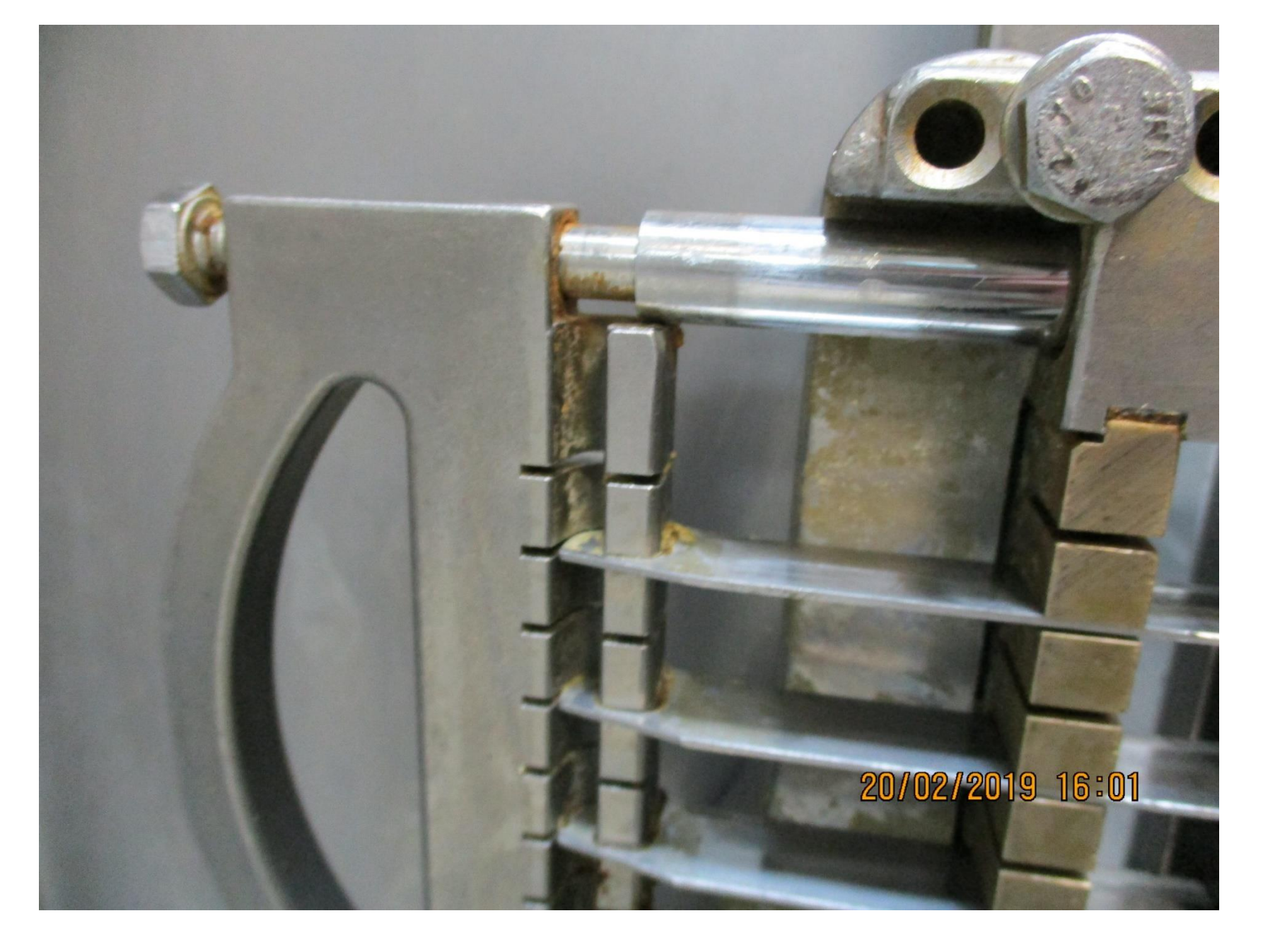
I Cook Foods – Butchery Area photo depicts food waste on vegetable processing equipment