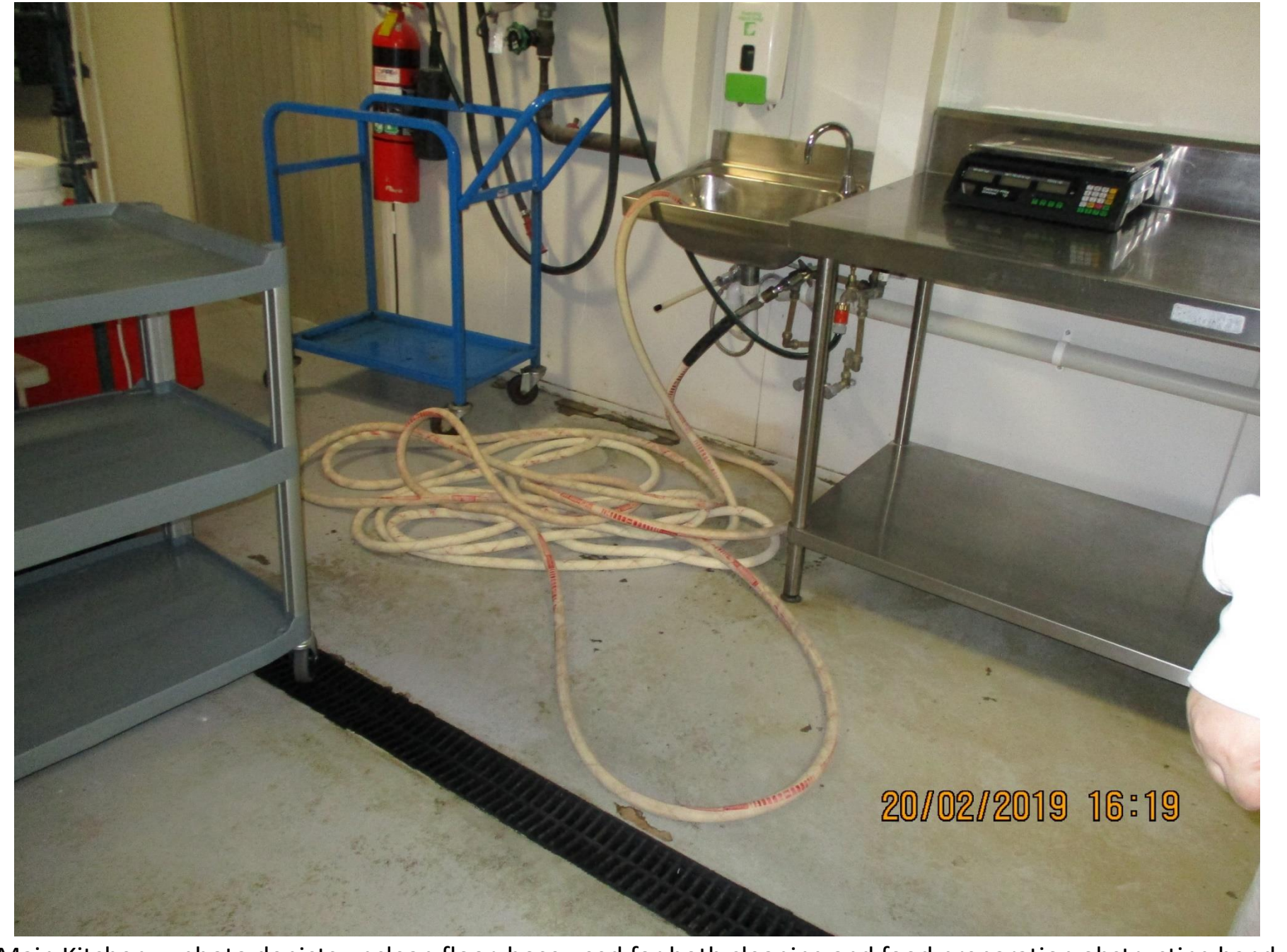
I Cook Foods – Main Kitchen photo depicts unclean floor, hose used for both cleaning and food preparation obstructing hand wash basin