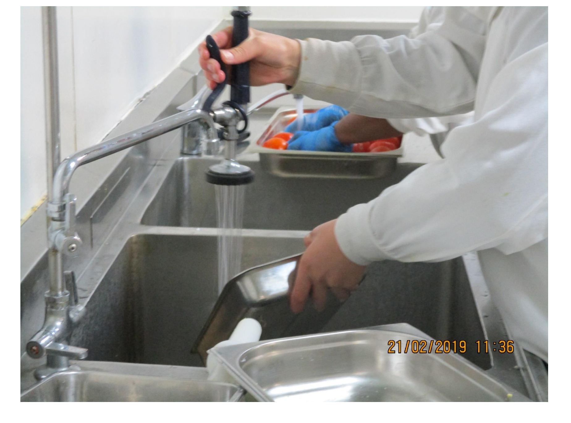
I Cook Foods – Butchery Area photo depicts tomatoes being washed next to dirty equipment being rinsed with water