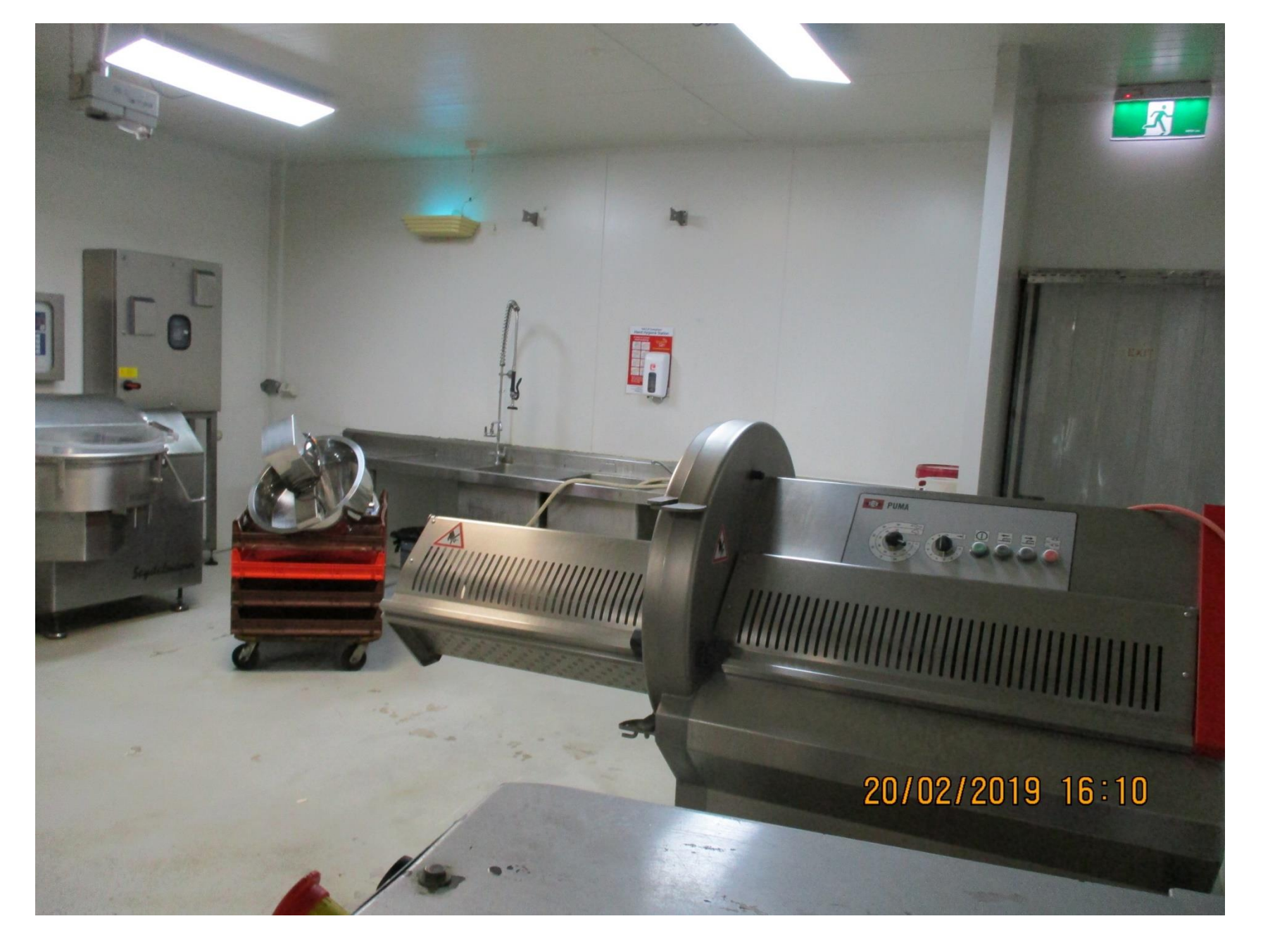
I Cook Foods – Butchery Area photo depicts food processing equipment in close proximity to dishwashing sinks LJ 12