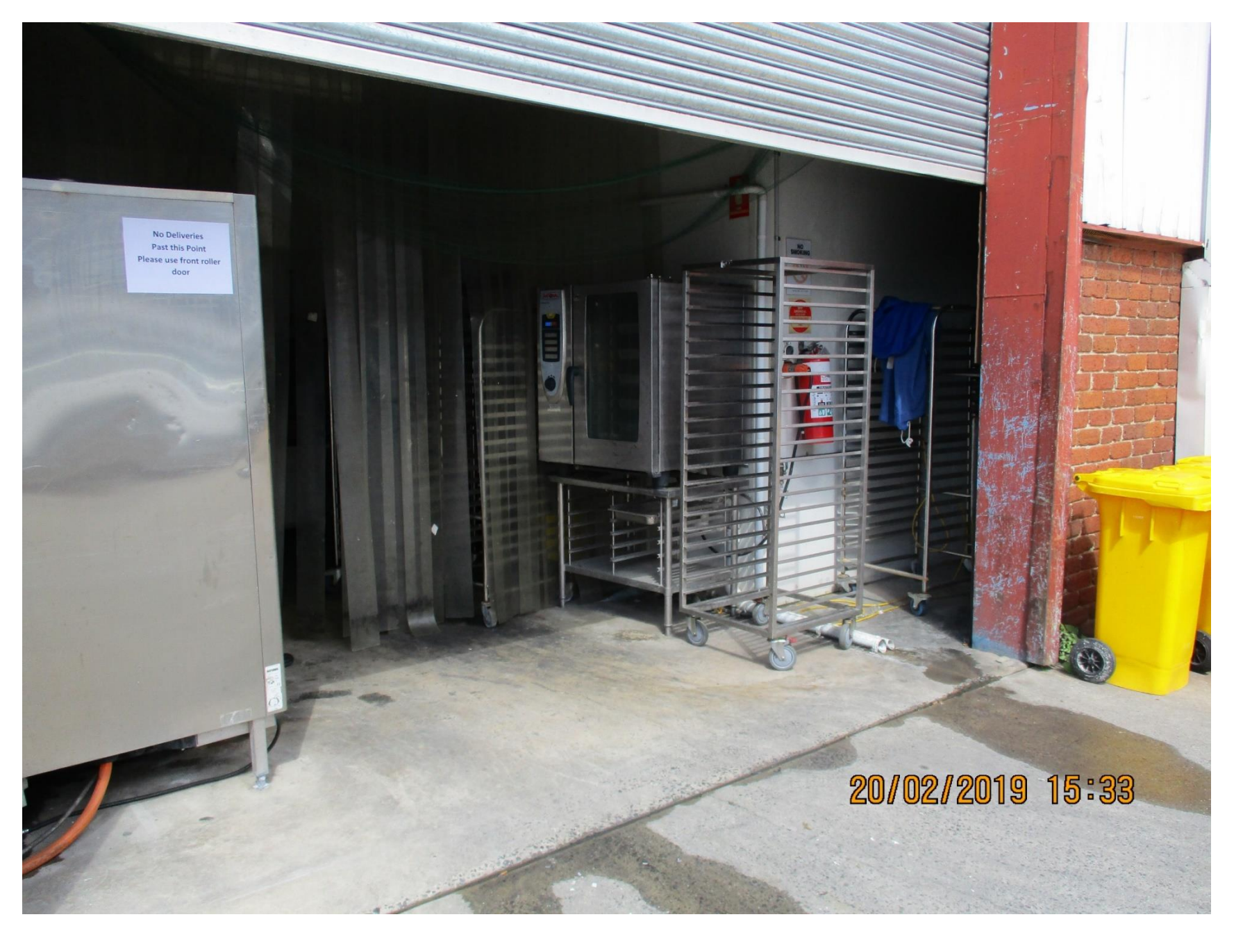
I Cook Foods - External Area to Cleaners Room photo depicts ovens used to cook foods exposed to external environment LJ 02