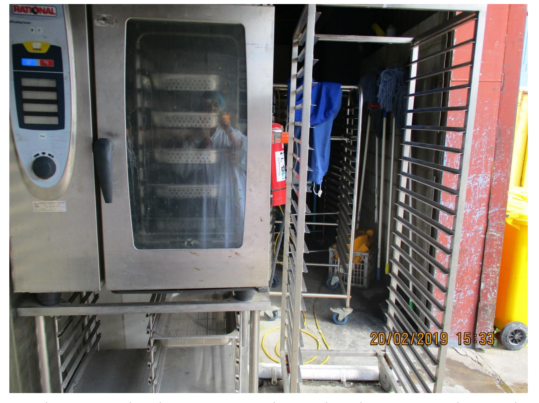
I Cook Foods - External Area to Cleaners Room photo depicts oven in use cooking meat located in an area exposed to external environment LJ01