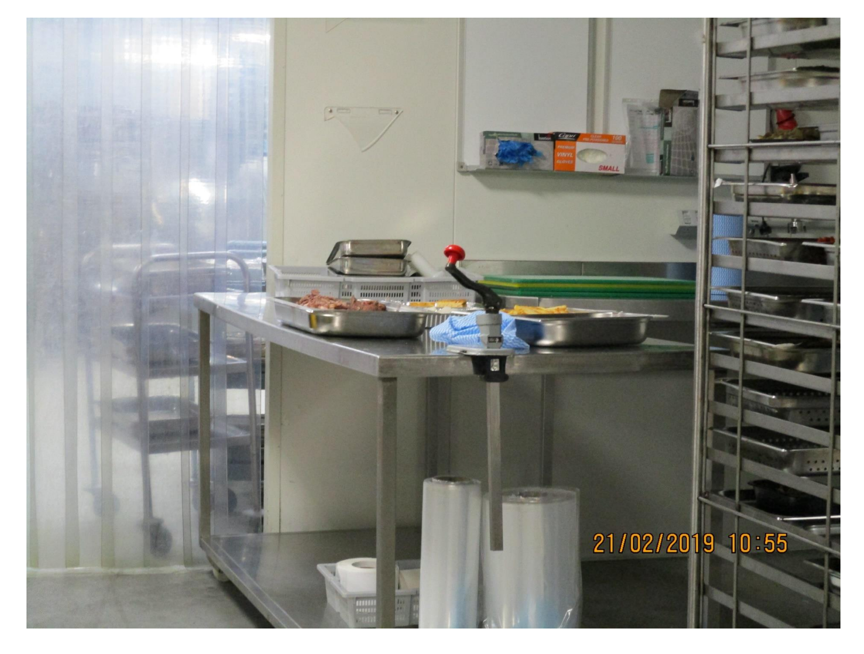
I Cook Foods – Mincing Area photo depicts exposed ready to eat foods located next to walkway