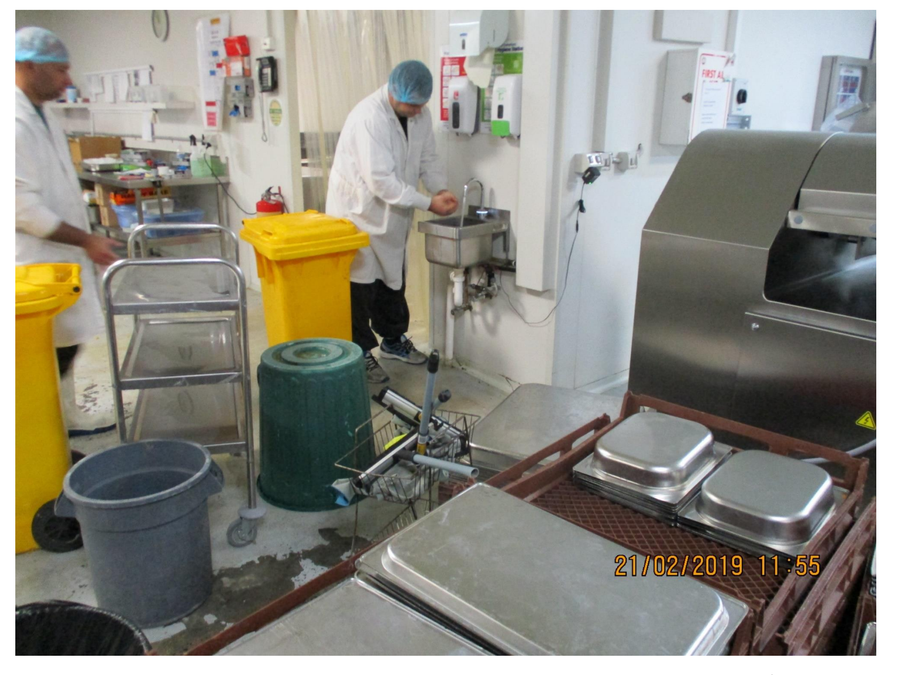
I Cook Foods – Main kitchen photo depicts rubbish bins and cleaning equipment stored next to food preparation area