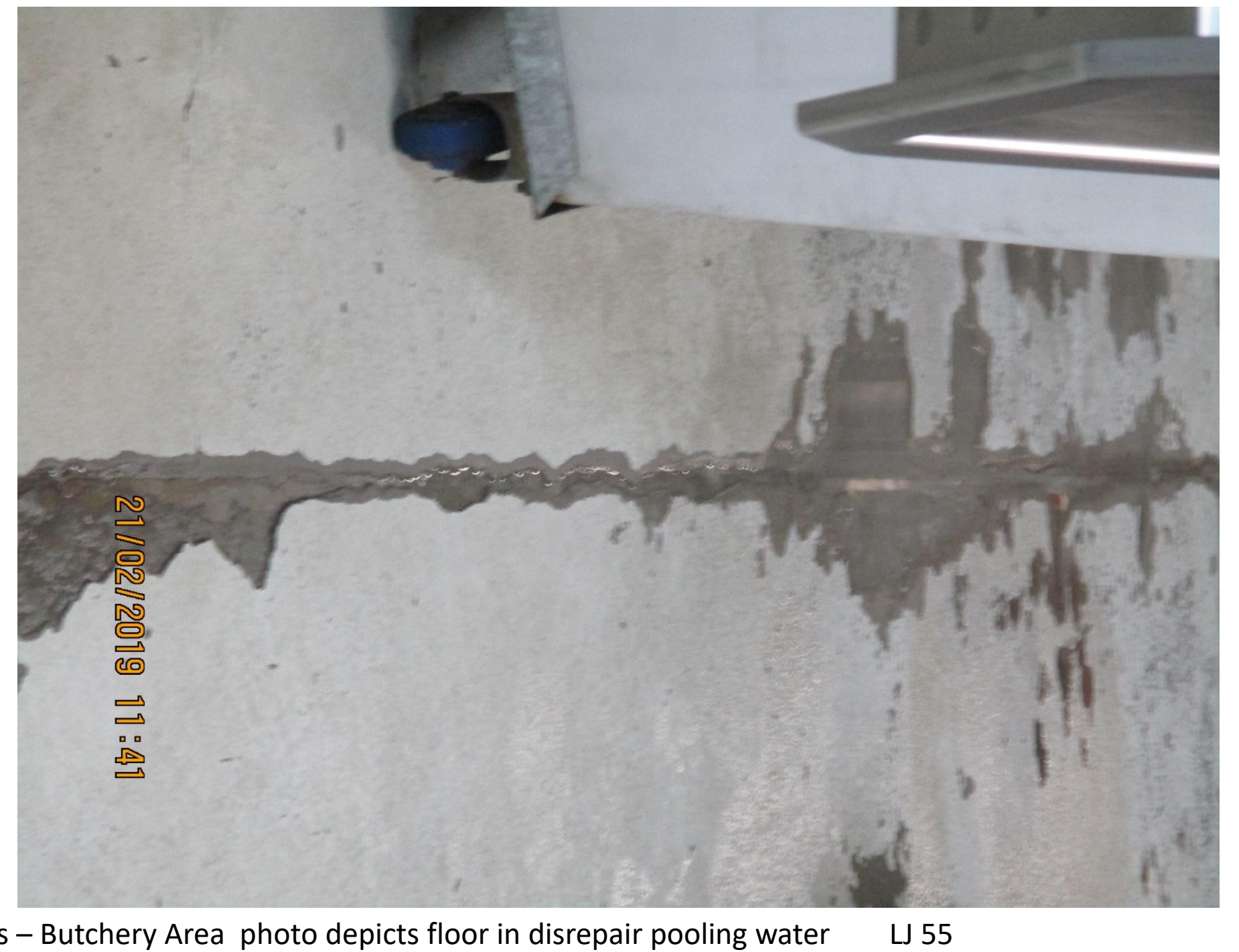
I Cook Foods – Butchery Area photo depicts floor in disrepair pooling water