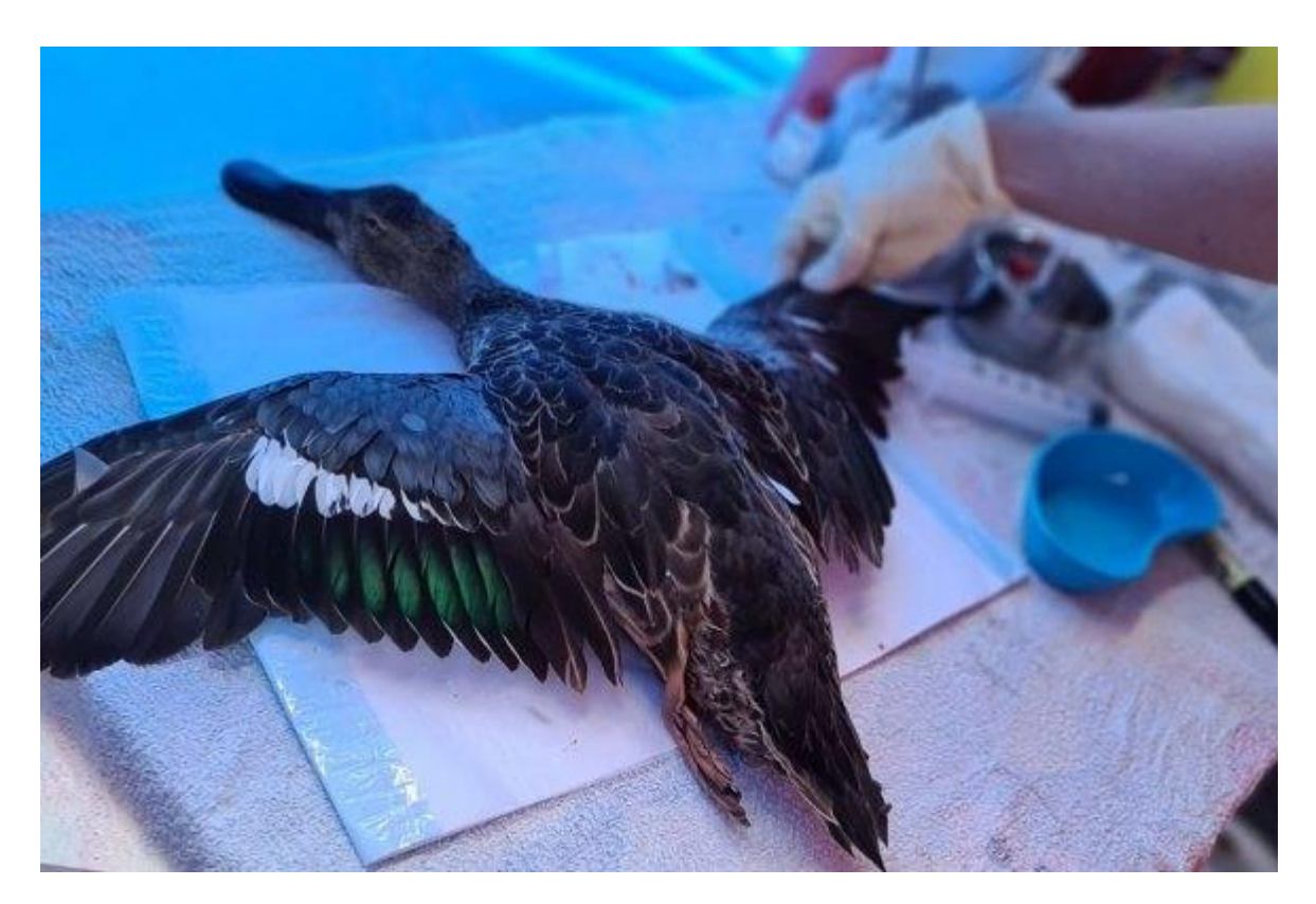
An endangered blue-winged shoveler duck-being examined by a Wildlife Victoria vet. It was later euthanised.

But when he went back on Wednesday morning, there were about 15 hunters in the same area of reeds as some nests, and the swans had flown.