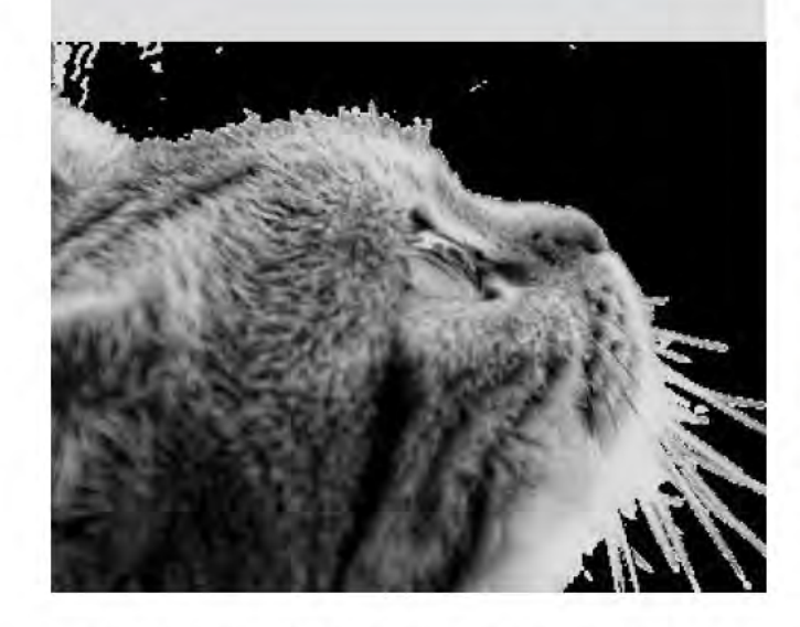
Identifying Best Practice Domestic Cat Management in Australia

Variations in legislative provisions and requirements for feral and domestic cat management between states and territories make a consistent, best practice approach to cat management extremely challenging. Existing legislation is at different stages of review and there are significant inconsistencies at the state and local government level in the approach and level of commitment to cat management. There is huge potential to improve animal welfare and increase the success and cost-effectiveness of cat management by tackling these inconsistencies and improving coordination between state and local government (Recommendation 2). Notwithstanding this, there is also a need to ensure that management strategies are context-appropriate: different approaches are required towards managing domestic cats in urban and suburban areas, rural communities, remote indigenous communities, ecologically sensitive locations, or on islands.