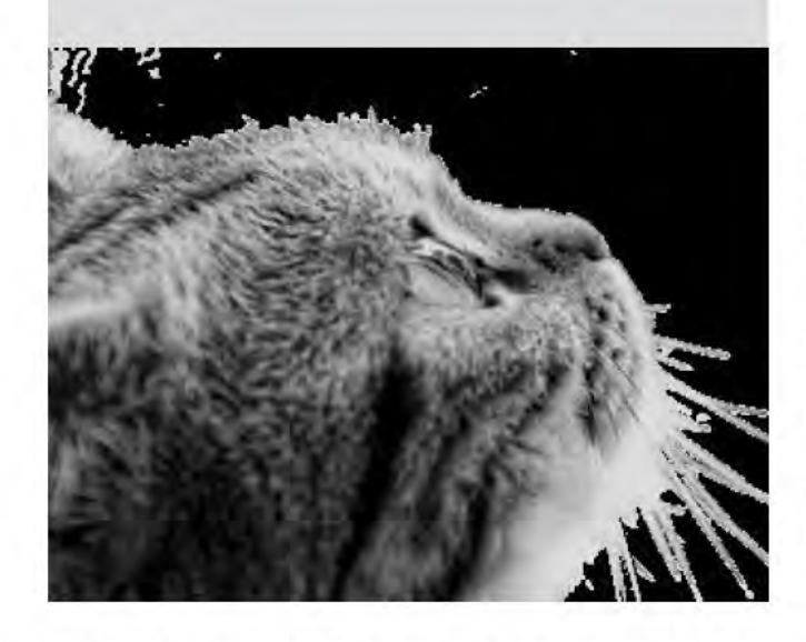
Identifying Best Practice Domestic Cat Management in Australia