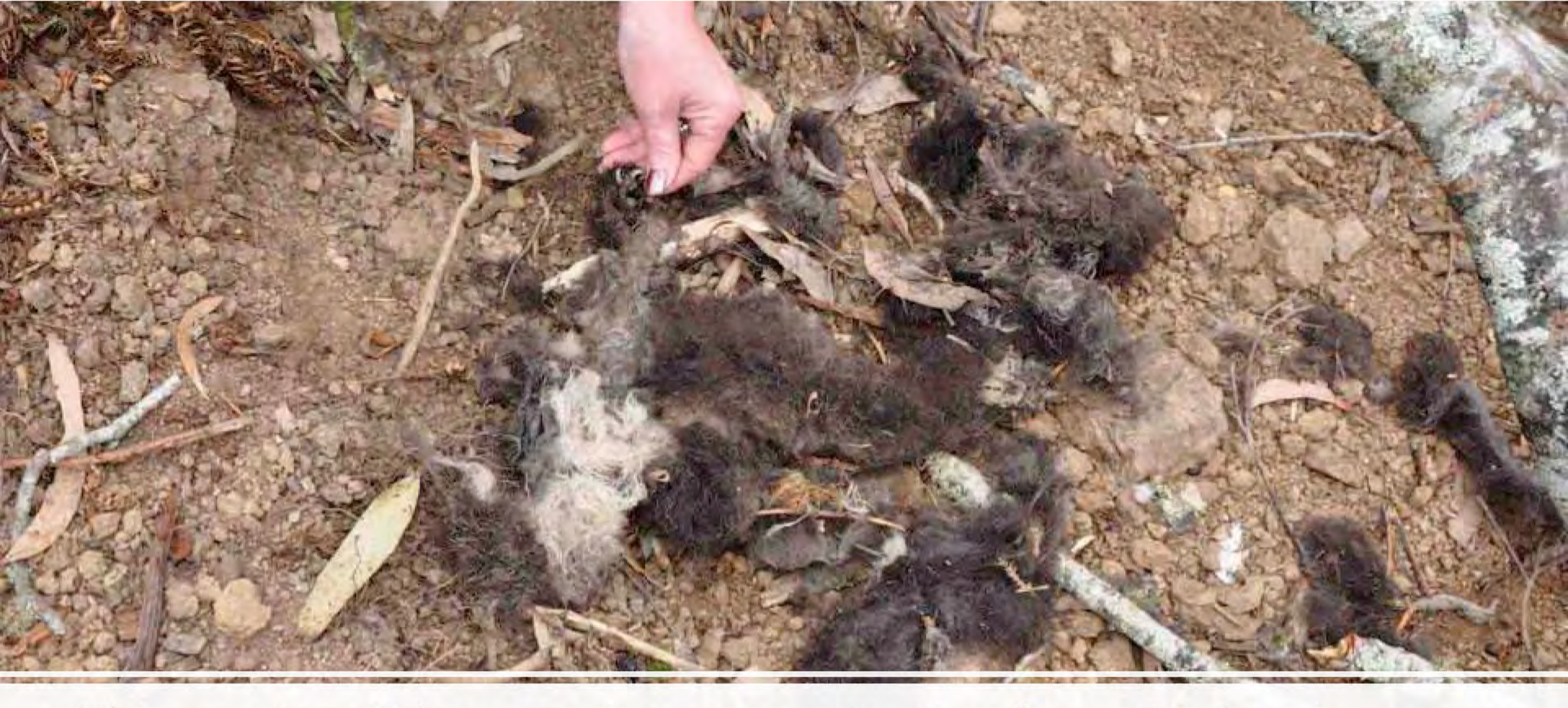
This greater glider was given no protection from this logging coup