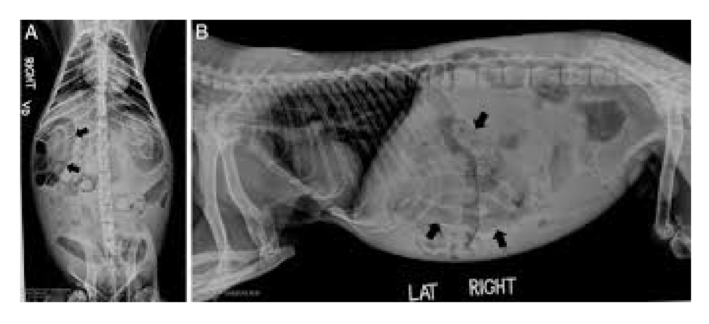
Causal effect –stress