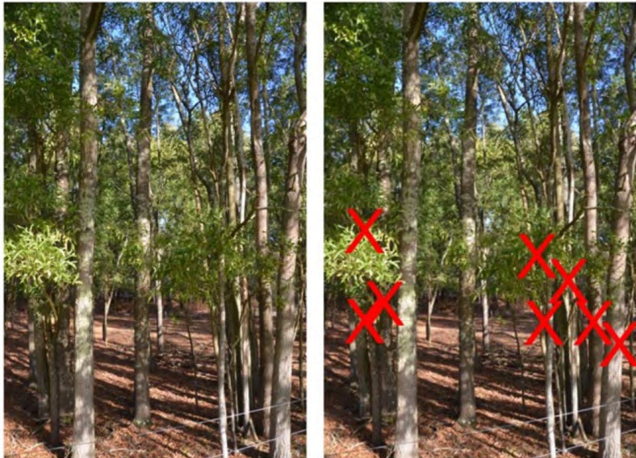
Thinning to release the best performing trees