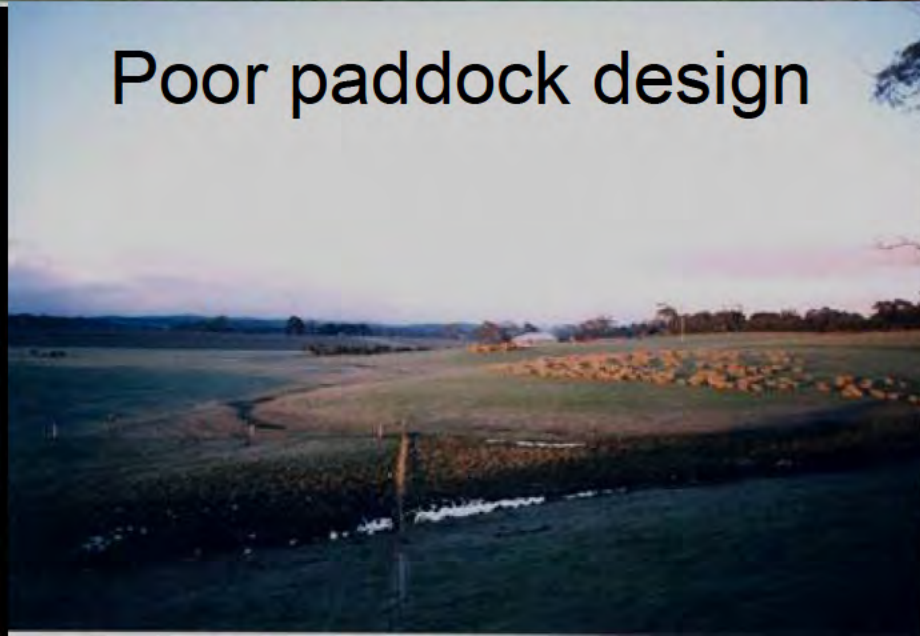
Poor paddock design