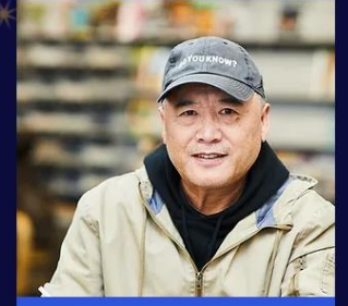
PAKENHAM LIBRARY Cnr. John Street &, Henry Street, Pakenham VIC 3810 <u>CLICK FOR MORE</u>