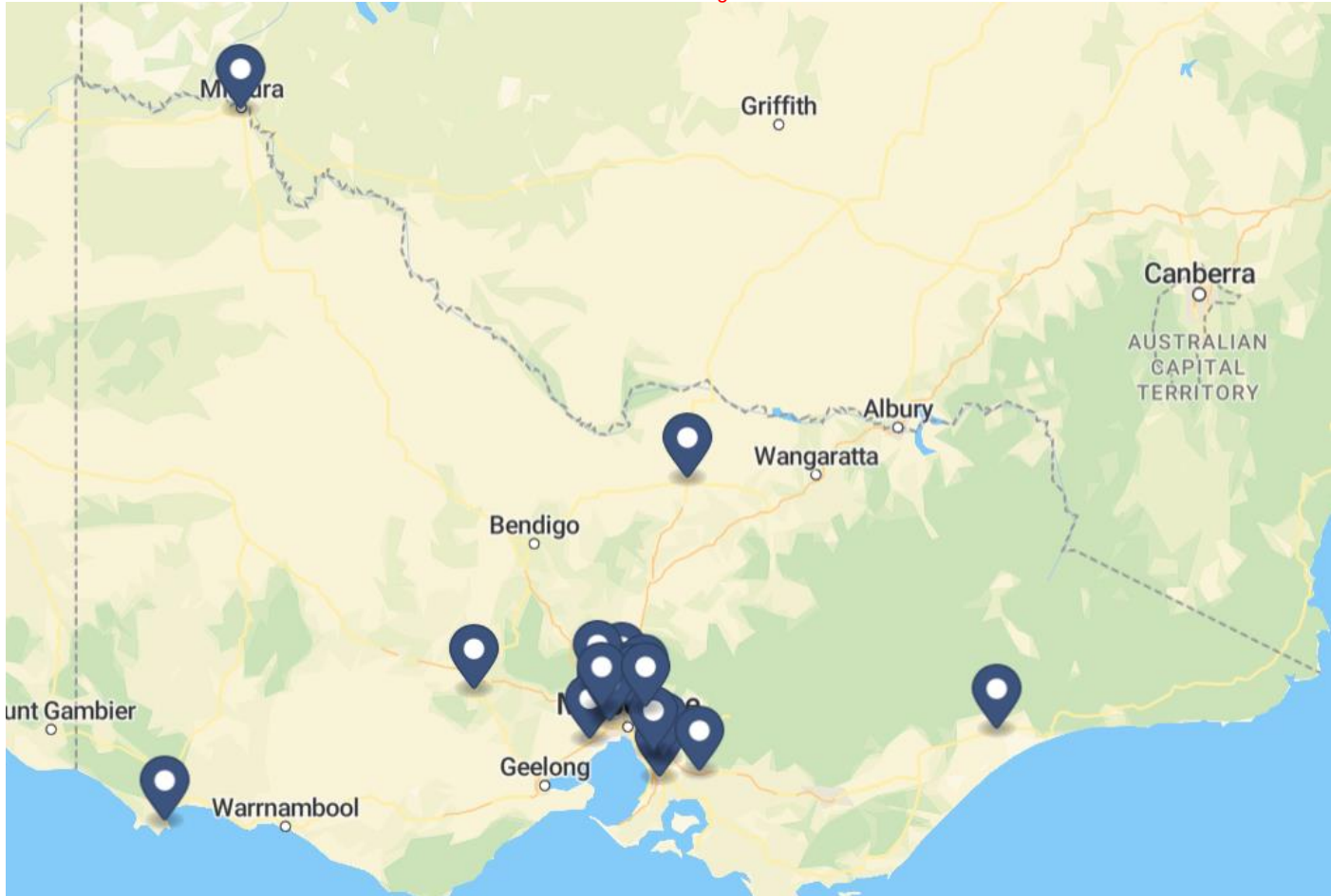
Program coverage across Victoria and (overleaf) across metropolitan Melbourne