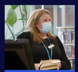
CARRUM DOWNS LIBRARY 203 Lyrebird Drive, Carrum Downs VIC 3201 CLICK FOR MORE