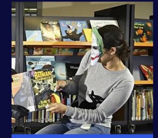
GREATER DANDENONG LIBRARY 225 Lonsdale Street, Dandenong VIC 3175