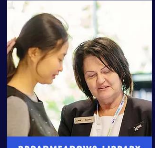
BROADMEADOWS LIBRARY Hume Global Learning Centre - Broadmeadows 1093 Pascoe Vale Road, Broadmeadows VIC 3047 <u>CLICK FOR MORE</u>