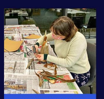
CRAIGIEBURN LIBRARY Hume Global Learning Centre - Craigieburn 75-95 Central Park Avenue, Craigieburn VIC 3064 <u>CLICK FOR HERE</u>