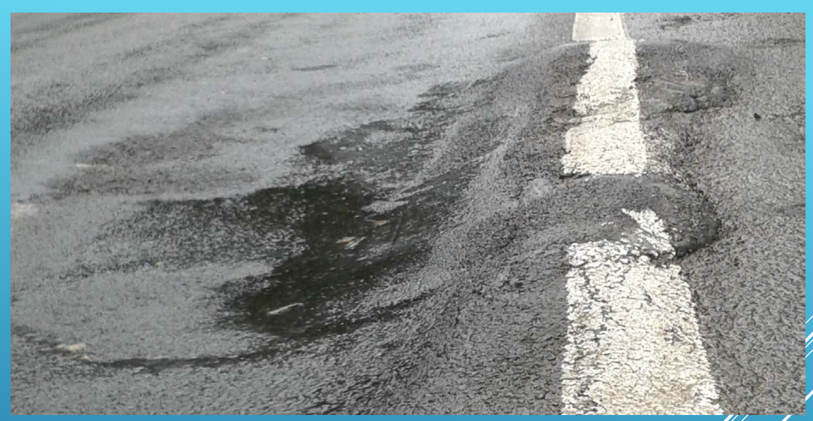
Princes Highway Heywood to Mount Gambier