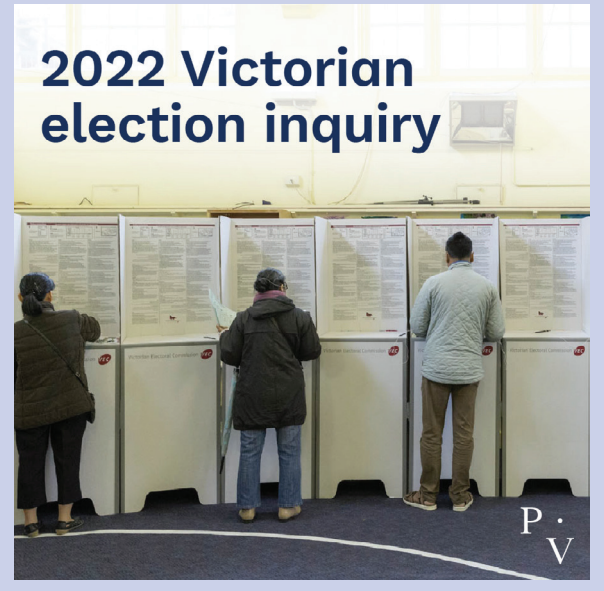
Download square tile v2 (JPG, 456 KB)