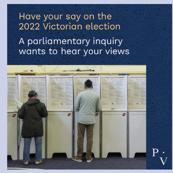
Download square tile v1 (JPG, 687 KB)