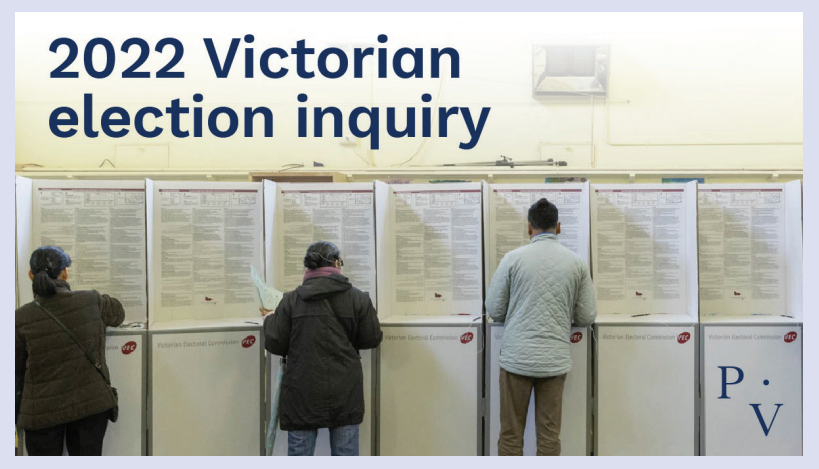
Download rectangle tile v2 (JPG, 332 KB)