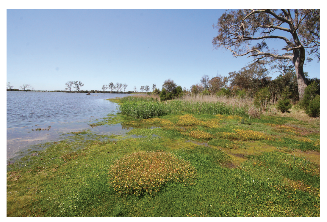
Heart Morass Wetland.

... that might include deliveries from jointly managed environmental water across jurisdictions, through the Living Murray program, Commonwealth environmental water holdings and Victorian environmental water holdings. The way in which they will flow is that they will be released from storage, they might flow through Barmah, then through Gunbower, along the River Murray, be pumped out to Hattah and some of it returns to the river and waters the Lower Lakes Ramsar site in South Australia. So the budget configuration is very difficult to attribute site by site, because investment is often targeted at multiple geographic areas, but to achieve benefit at the Ramsar site.<sup>173</sup>