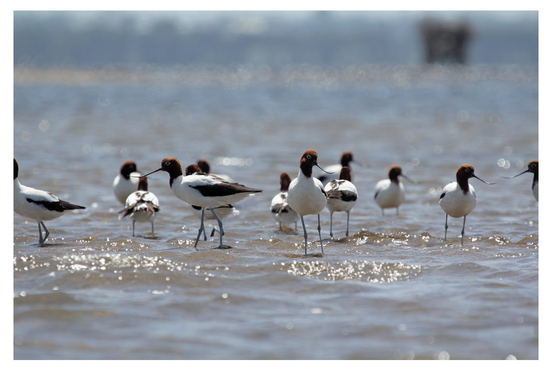
Red-necked Avocets.

DELWP has established a statewide monitoring, evaluation, reporting and improvement MERI framework, which forms the basis of individual MERI plans for Ramsar sites. These documents are not publicly available.