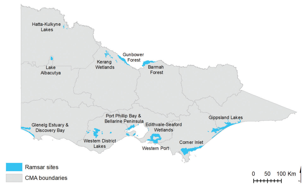
Figure 1.1 Victoria's Ramsar sites