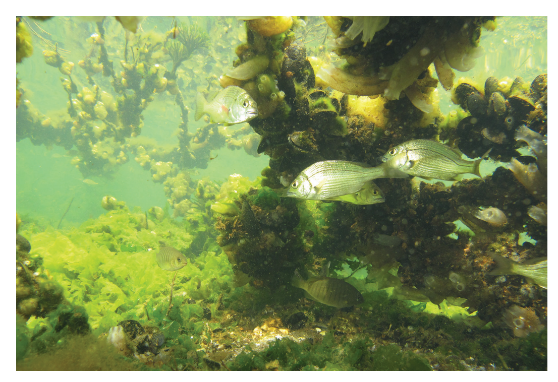
Black Bream.

FINDING 4: The Committee found that governance of the Gippsland Lakes Ramsar site was sound and one of the better practice examples throughout the state. The East Gippsland Catchment Management Authority has established effective mechanisms to manage the site, including arrangements with key stakeholder groups.