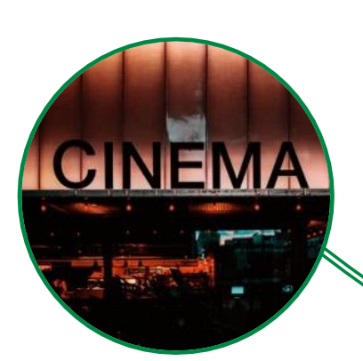
Cheltenham entertainment, retail, creative and services