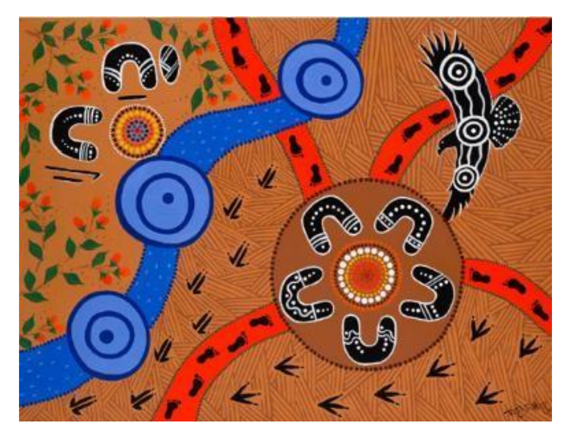
'Origin: Victoria, Australia (2021)'