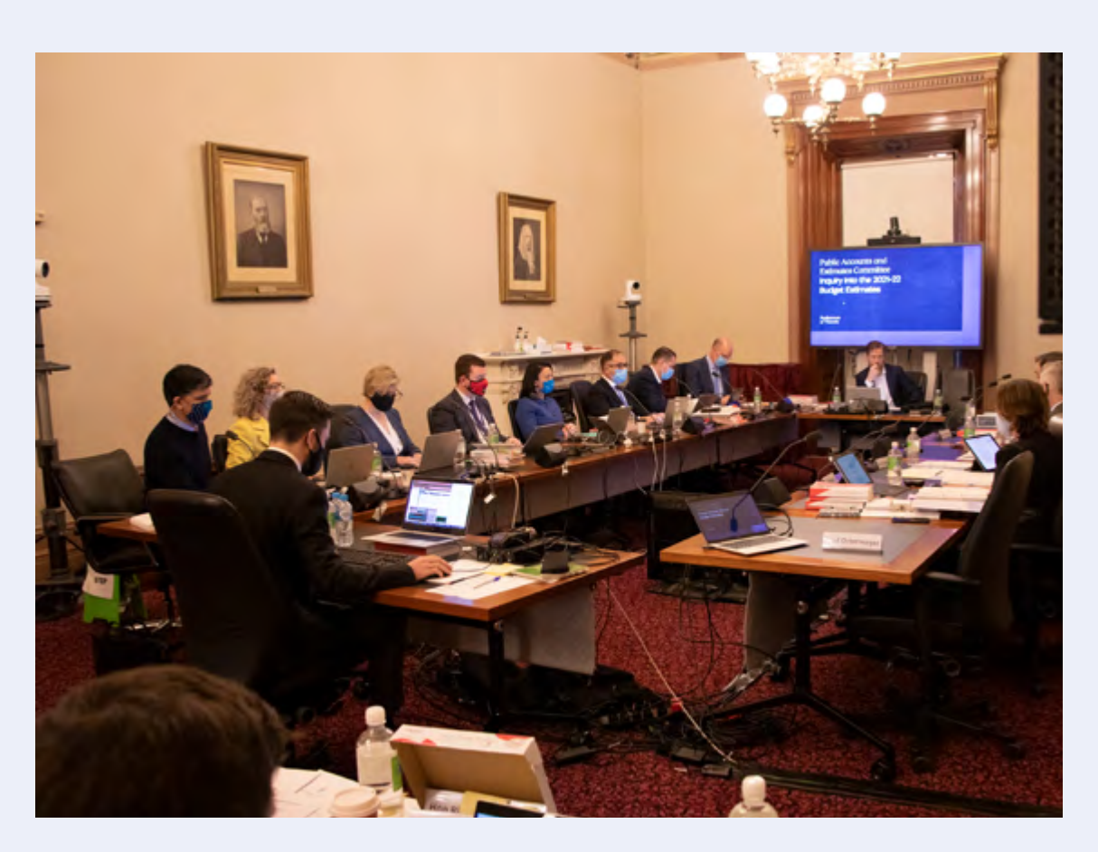
The Public Accounts and Estimates Committee Inquiry into the Budget Estimates.

The questions they ask the stakeholder groups may need to be adjusted, taking into consideration what perspectives each group might have.