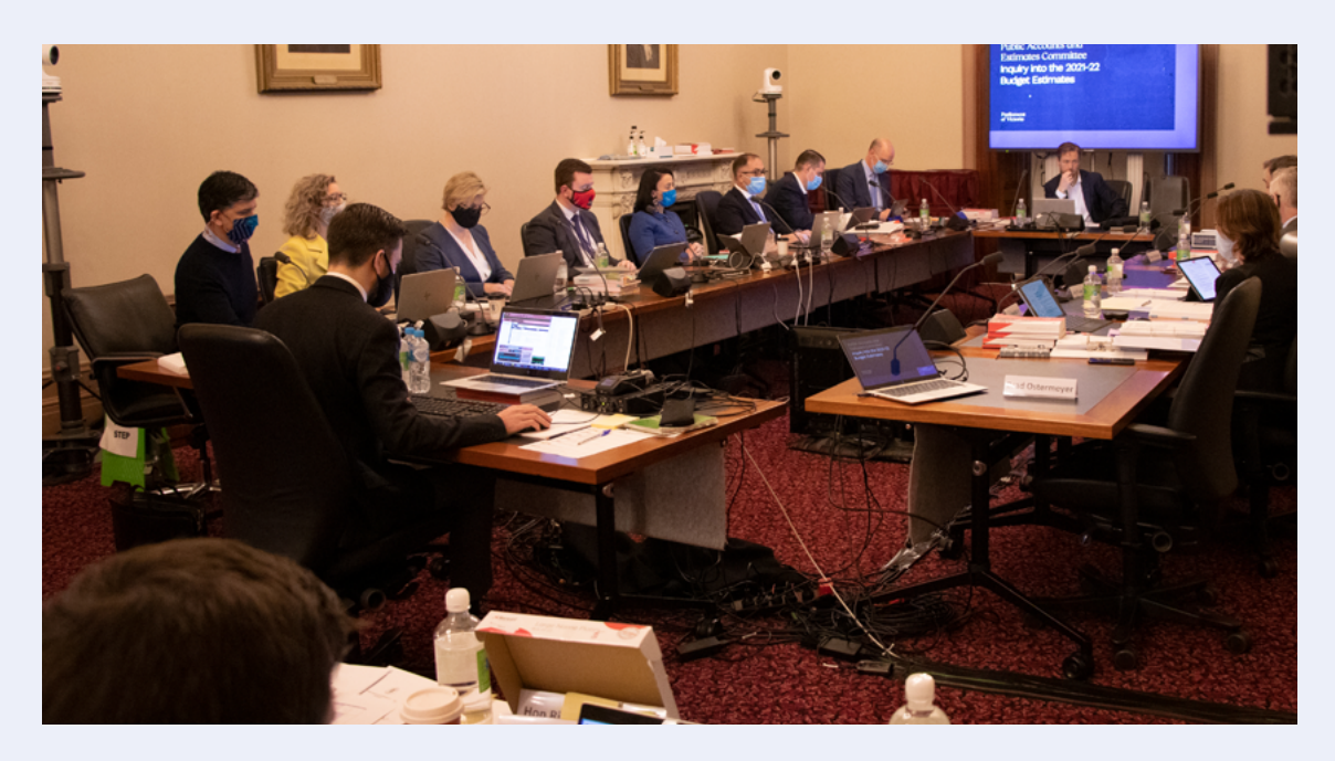
The Public Accounts and Estimates Committee Inquiry into the Budget Estimates.

Th courts don't generally formally participate in committee inquiries; an exception, for instance would be the contribution of the Coroner's Court to inquiries such as the Voluntary Assisted Dying bill or the inquiry into the Medically Supervised Injecting Centre. However, if there is a proposed policy or legislation coming forward, particularly major legislation that affects a particular area of jurisdiction, the relevant government departments will consult the courts. For