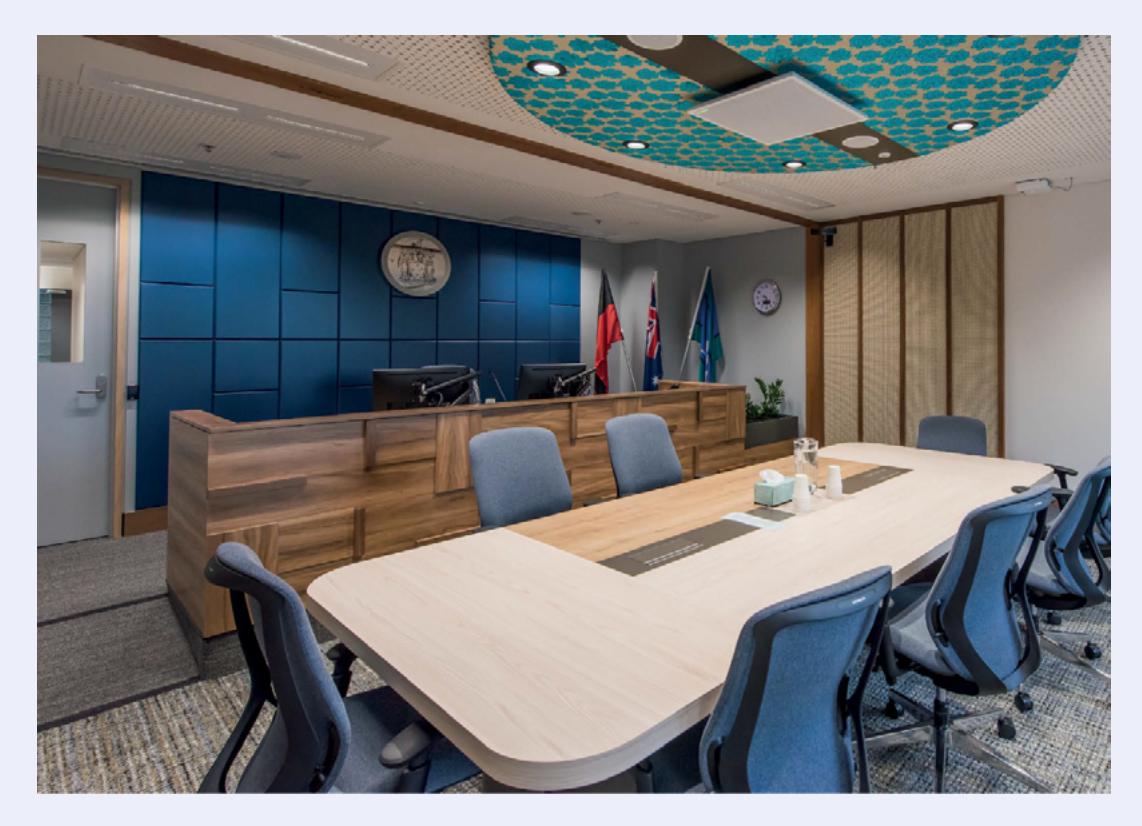
VCAT, the VictorianCivil and Administrative Tribunal, resolves disputes and makes decisions.

courts had to operate in a closed system. This restricted the way VCAT operated and there was limited opportunity to work on the papers; the work always required a hearing of some type. During the pandemic, a particular provision was altered, Section 100 of the VCAT Act, which allowed more work on the papers. The provision has been considered useful, and has subsequently become permanent; the close focus on how VCAT operated over the pandemic highlighted a particular way of working and parliament was happy to make that change.