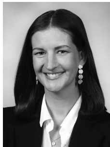
Ellen Sandell Melbourne