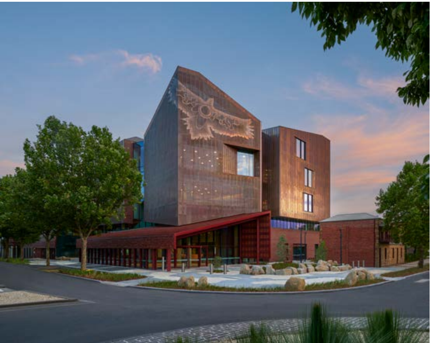
Exterior view of the Bendigo Law Court.