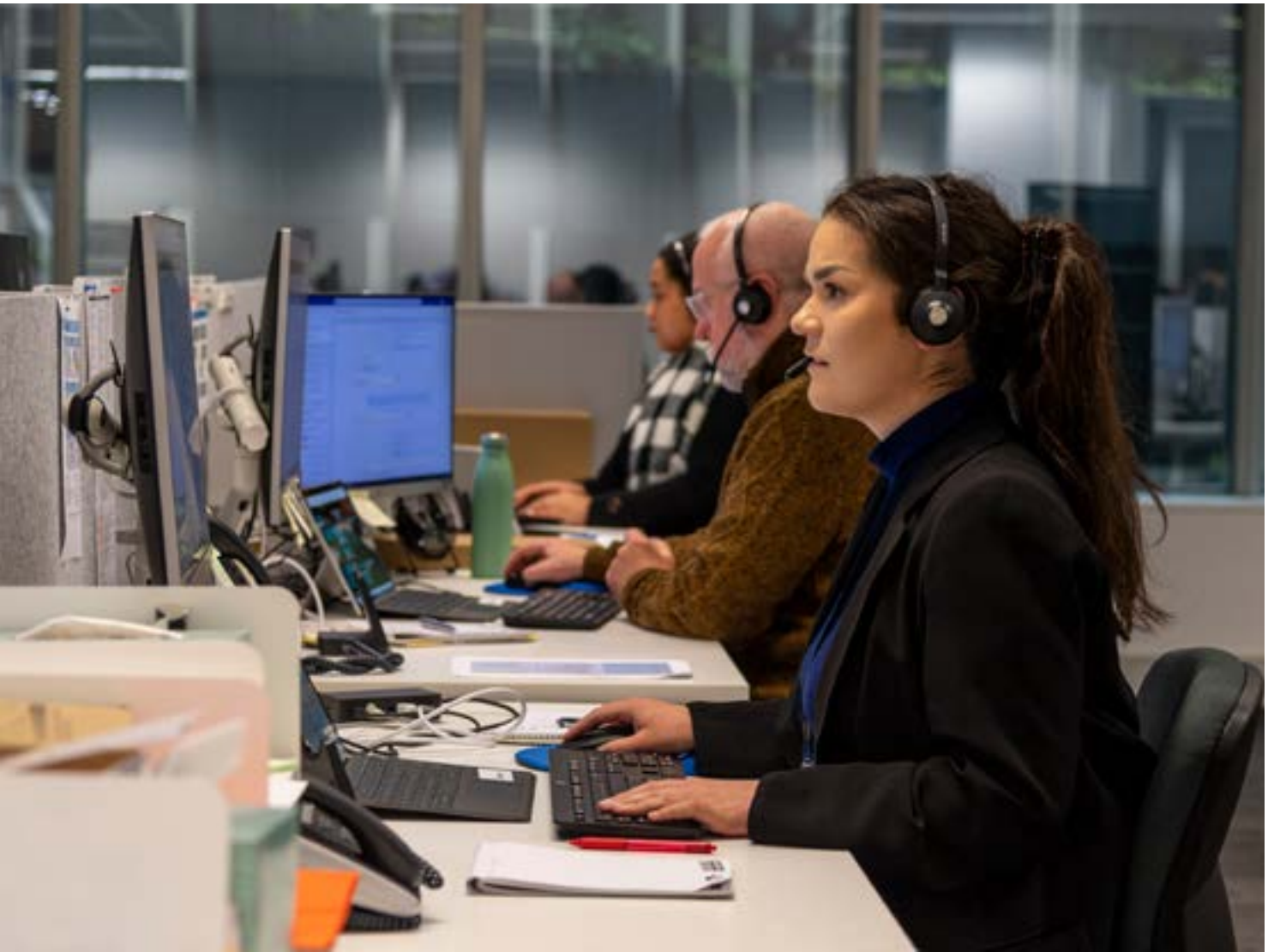
MCV Service Centre staff responding to court user enquiries

across all court locations. It ensures staff across our 51 locations, and our service centre, have access to the same, up-to-date guidance on court procedures, legislation, government policy and court practice directions. The KMS means that every time a court user contacts us, they can be confident they will get timely, accurate and high-quality information and responses to their enquiries.