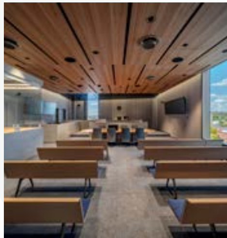
Bendigo Law Courts.