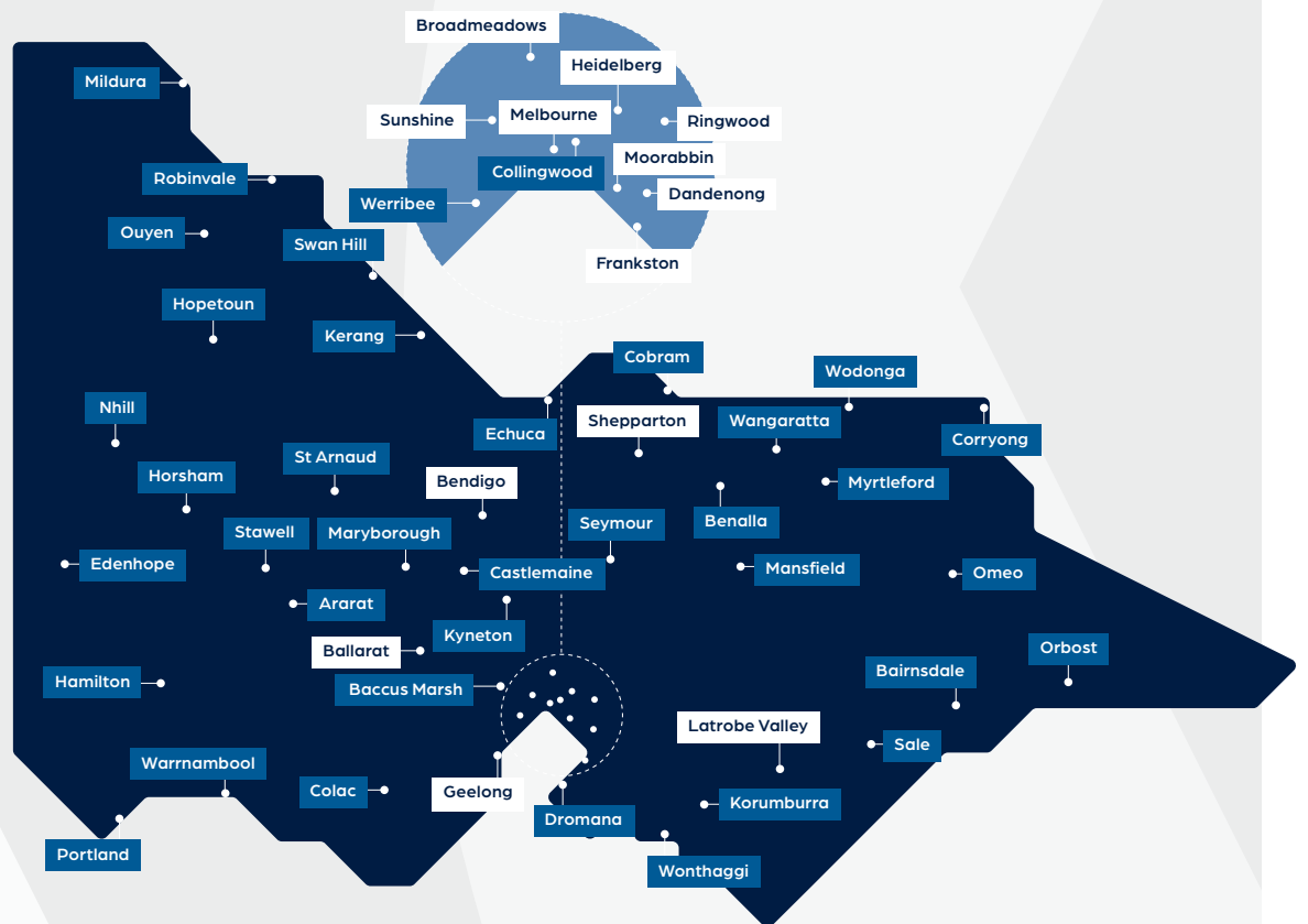
Figure 1: Map of MCV court locations

THE MAGISTRATES' COURT IS THE FIRST LEVEL OF THE VICTORIAN COURT SYSTEM. WE HAVE A DEDICATED WORKFORCE OF MAGISTRATES, RESERVE MAGISTRATES, JUDICIAL REGISTRARS AND STAFF WORKING ACROSS THE COURT'S 51 LOCATIONS.