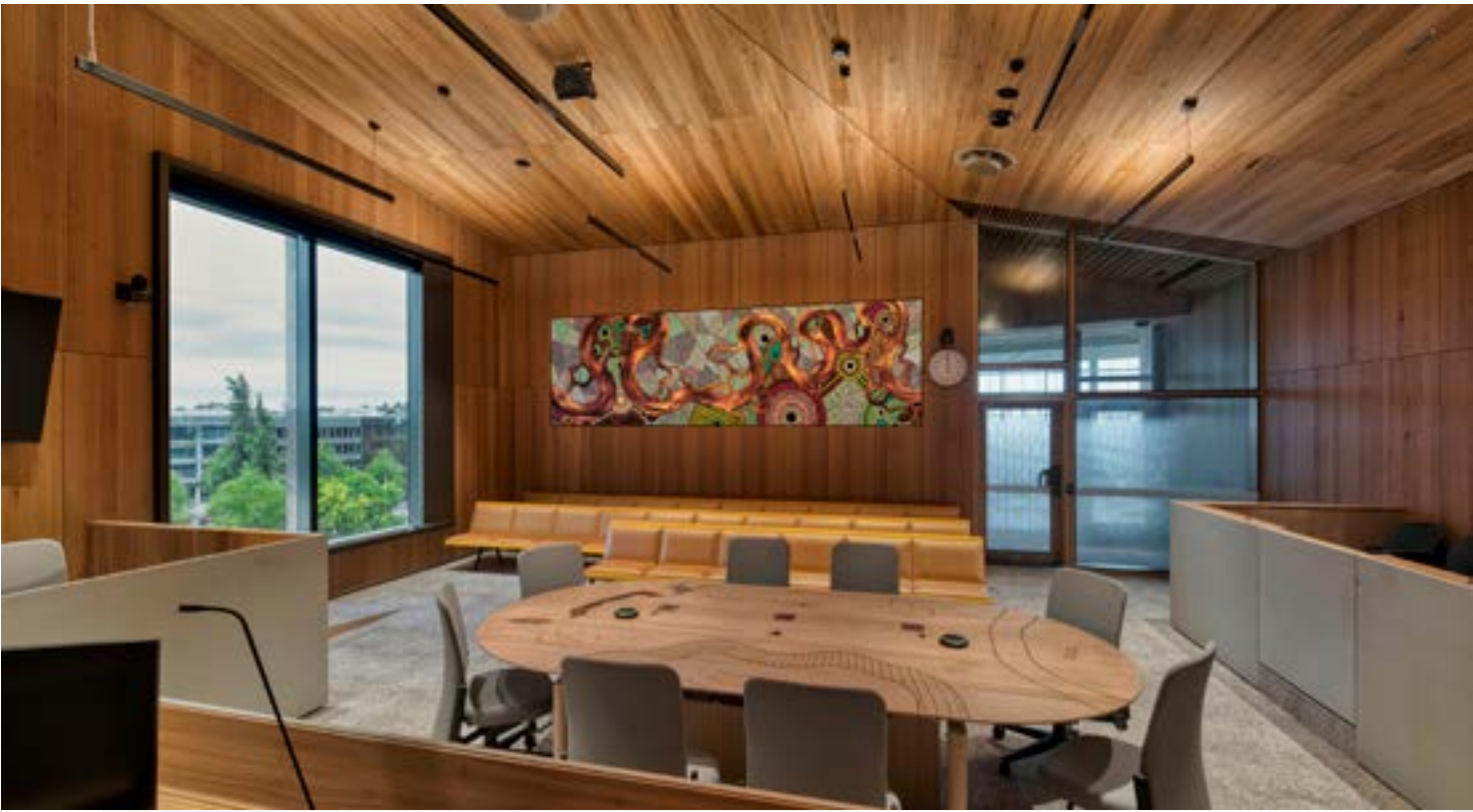
New Koori Court at Bendigo Law Courts