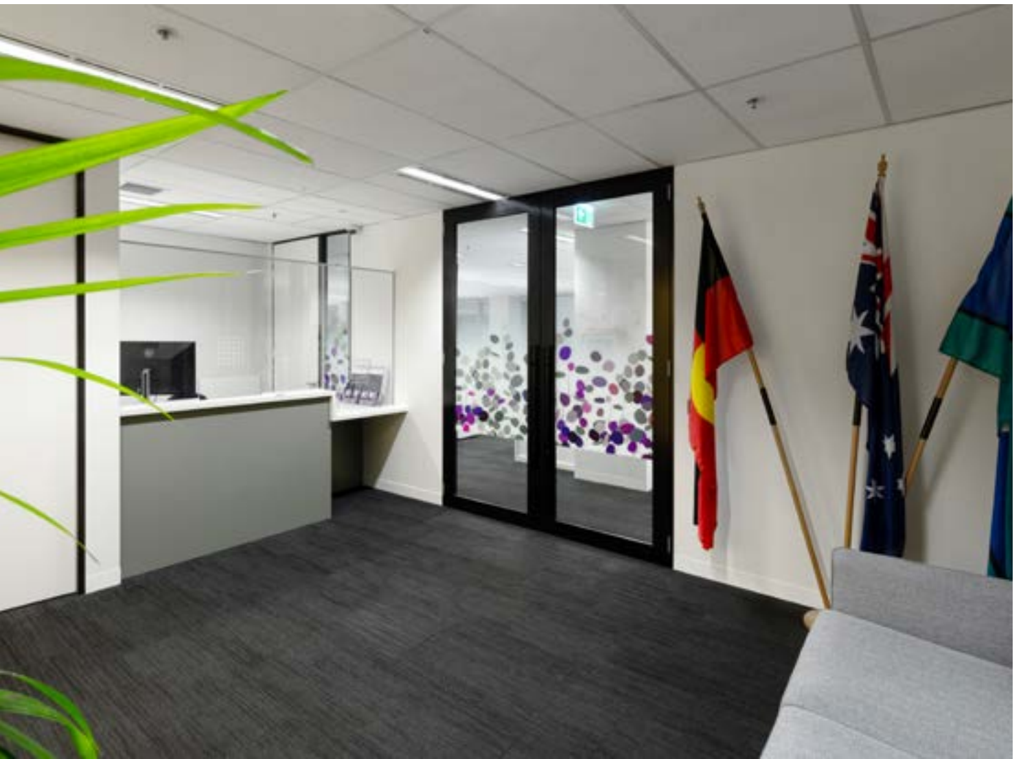
New VOCAT premises