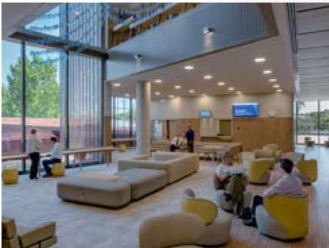
Waiting area at the Bendigo Law Courts.

Artworks by Djaara artists are exhibited throughout the building, enhanced by language elements in more than 40 locations. The design is anchored in Bendigo's unique heritage and culture of the Dja Dja Wurrung – Bendigo's Traditional Owners.