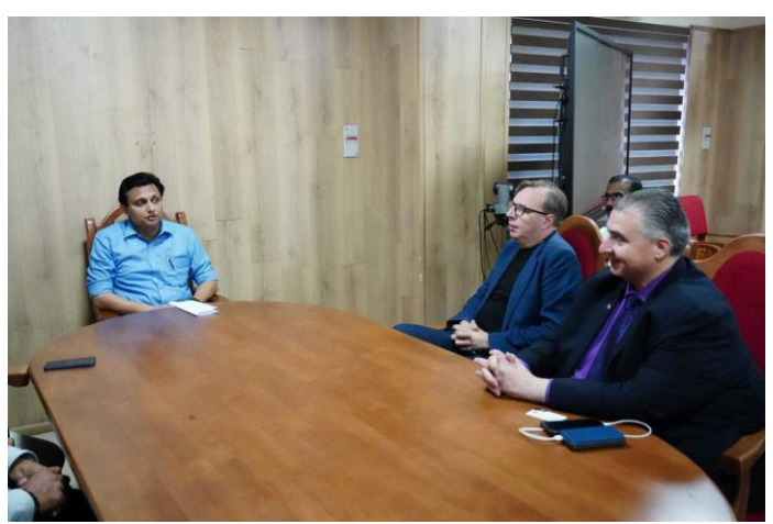
Meeting with the Minister for Tourism and PWD, Kerala