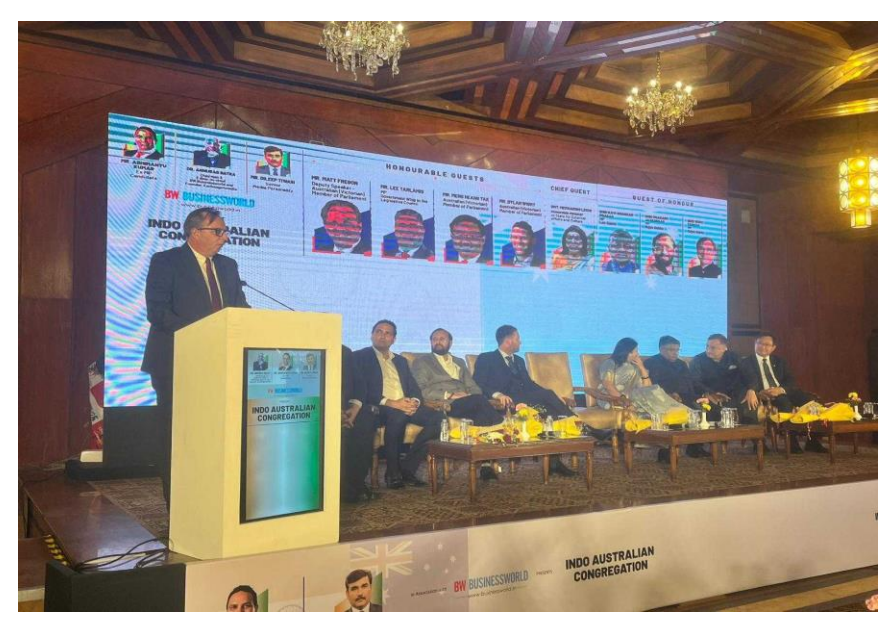
Indo-Australian Congregation Meeting