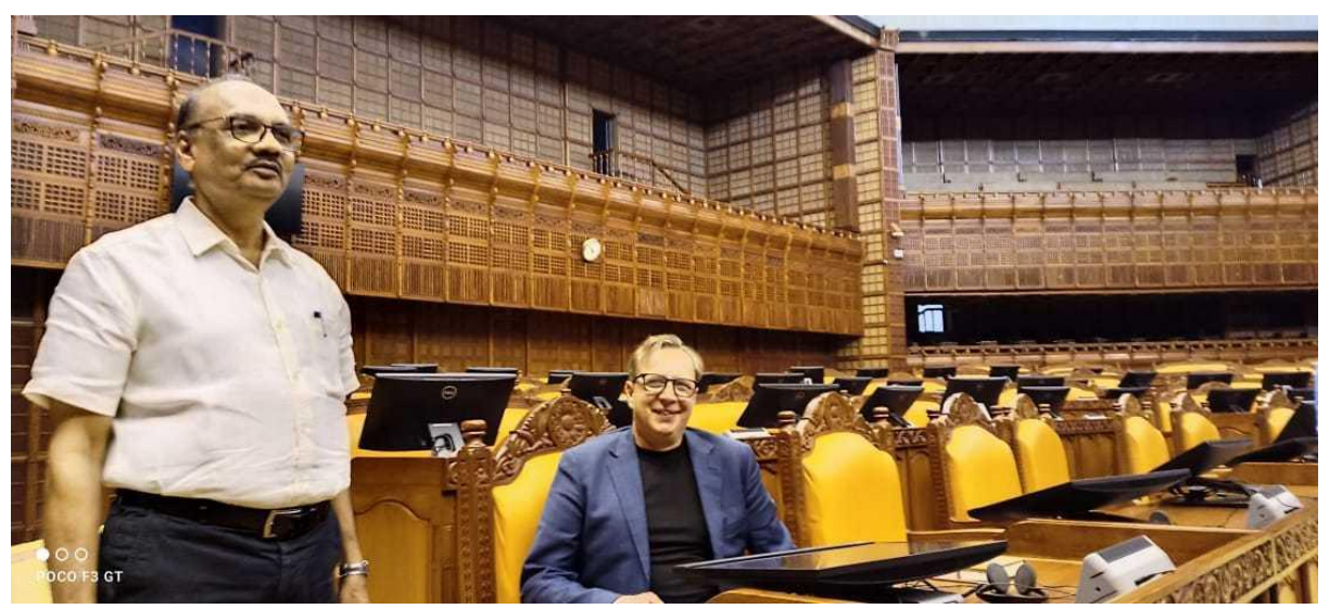
The Legislative Assembly of Kerala